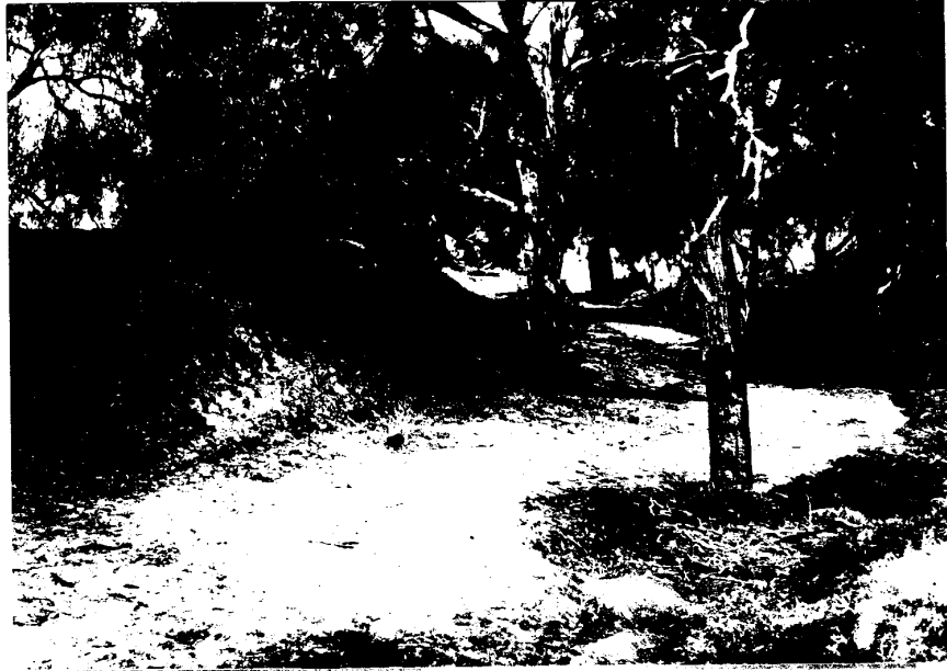
Plate 5 : Sandy bed of stream in lower reaches of Angas No. 1369