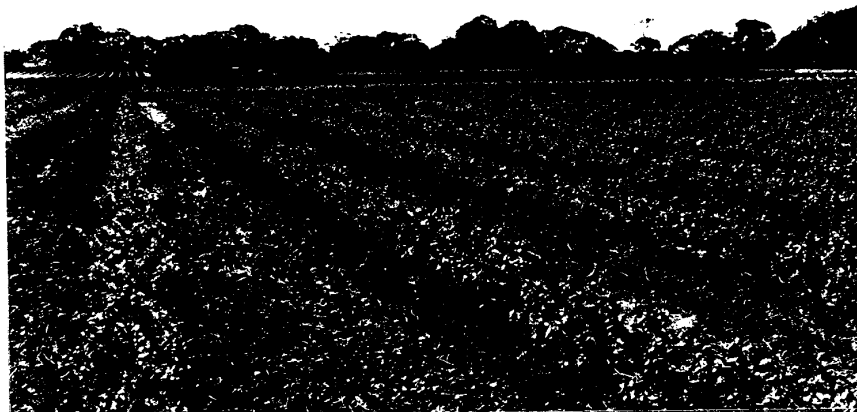
Plate 2 : Vineyards on the flanks of the Bremer River.