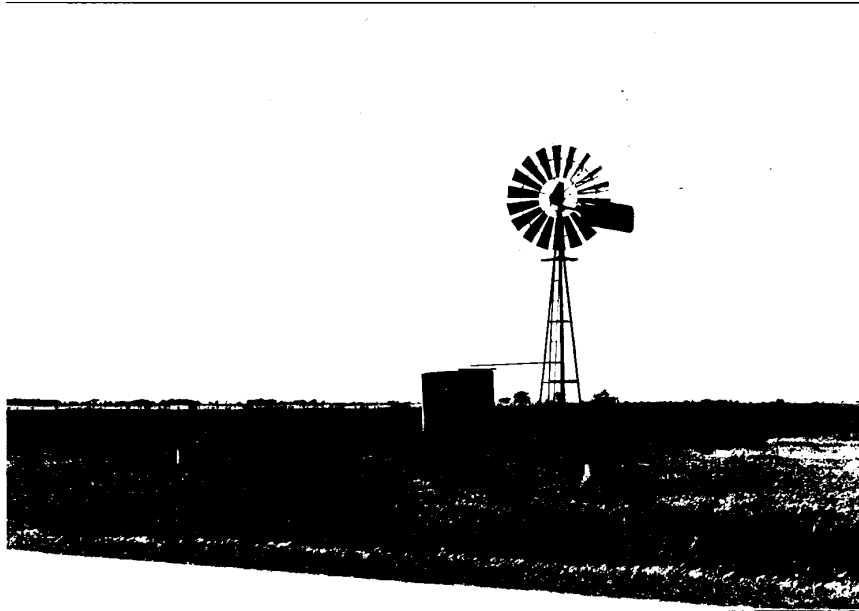
Plate 3 : Stock water supply pumped by windmill from the confined aquifer. Slide No. 13693