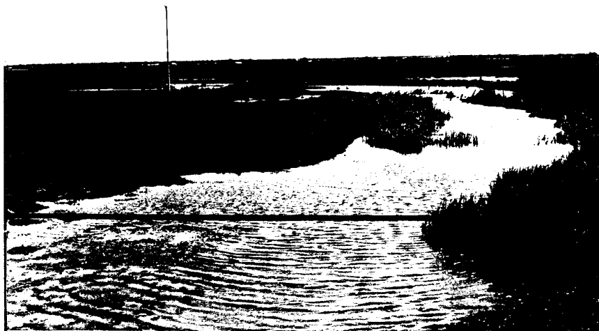
Plate 4 : Drowned mouth of the River Angas. Slide No. 13694