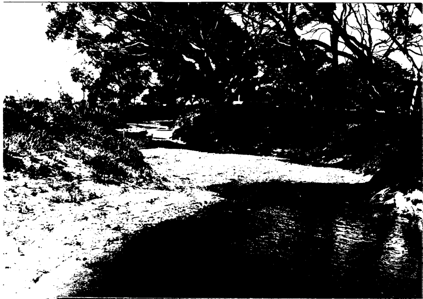
Plate 6 : Water ponding in lower reach of stream in Angas during a flow recession. No. 13698